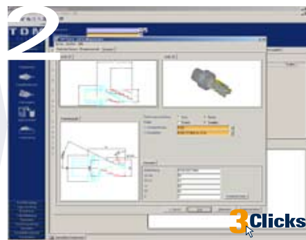
2 Creation of the 2D-graphic, the 3D-solid and the tool data.