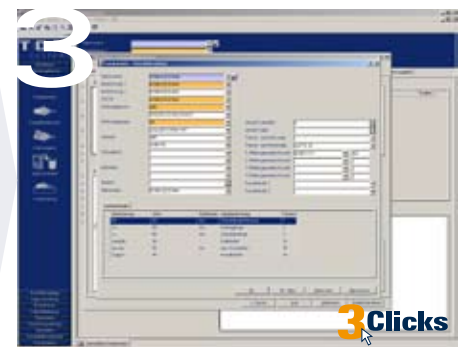
3 Data and graphics are stored in the TDM tool data base.