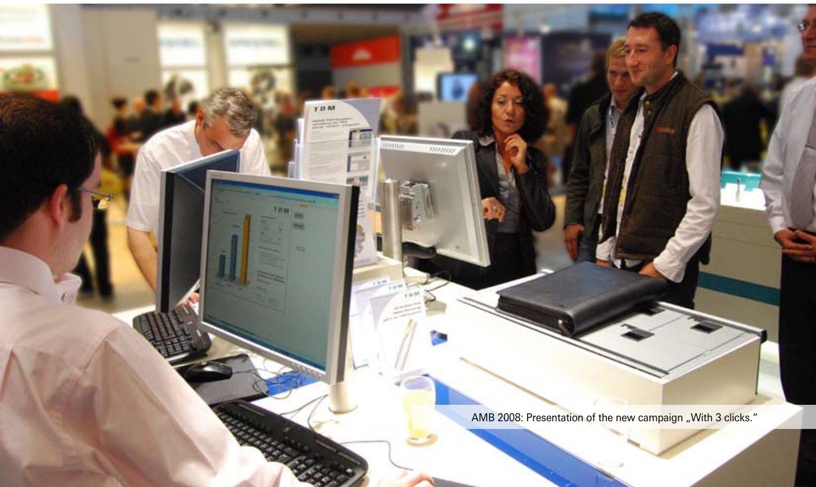
AMB 2008: Presentation of the new campaign „With 3 clicks.“

wanted a software that requires little prior training. Simple as an ATM, but also able to display and carry out every relevant process.“ After all, as he points out, „Good tool management is the key to trouble-free production“. With this in mind, the TDM software package now includes valuable new modules like TDMstoreasy (see p. 3) and – for